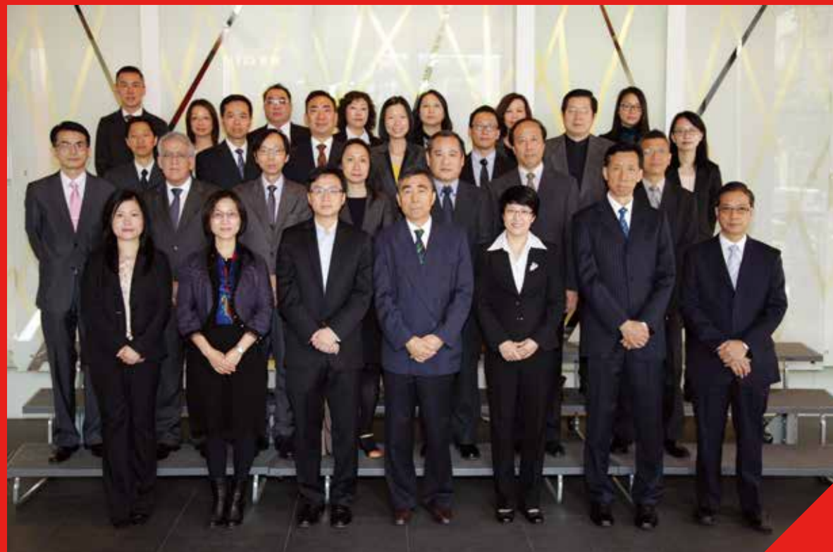
我院學術及行政單位主管 Heads of MPI Academic and Administrative Units