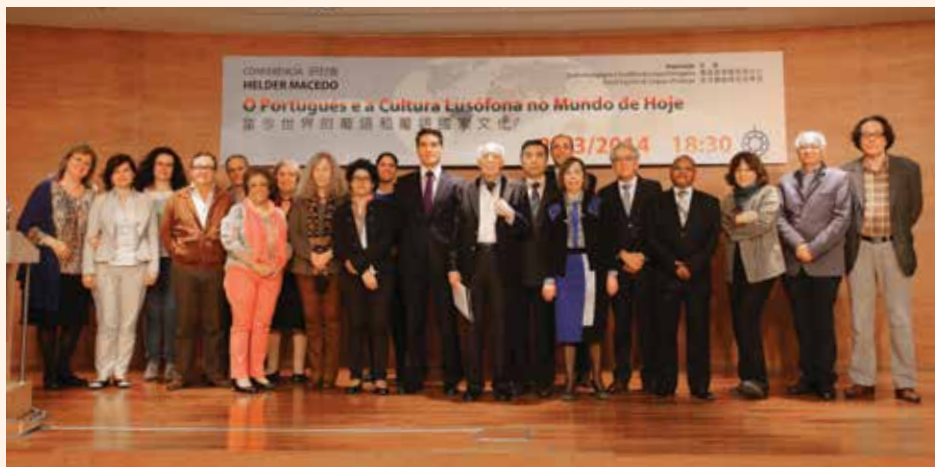
當今世界的葡語和葡語國家文化研討會 Conference on Portuguese and Lusophone culture in the present world.

The Centre was created not only to implement our national policy more effectively, but also to meet the demands arising from social development. The Centre will join with other academic units of MPI to fulfil the missions of teaching and research. We believe that, based on the resources of our Institute, and from the perspective that the Portuguese language and cultures are attracting greater attention, the Centre will evolve to play an ever more important role in economic and cultural exchanges with Lusophone countries.