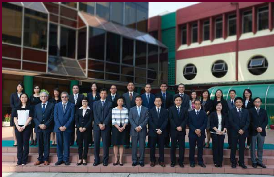
我院學術及行政單位主管 Heads of MPI Academic and Administrative Units