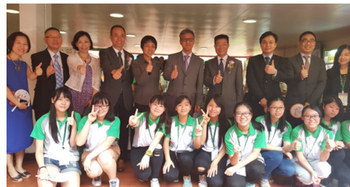
The Creative Art-ship Products Fair