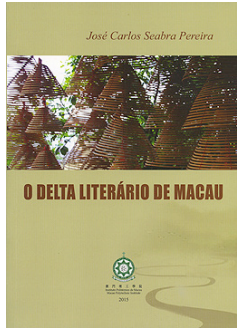
O Delta Literário de Macau獲葡萄牙Eduardo Prado Coelho獎項

— O Delta Literário de Macau won the Eduardo Prado Coelho Award