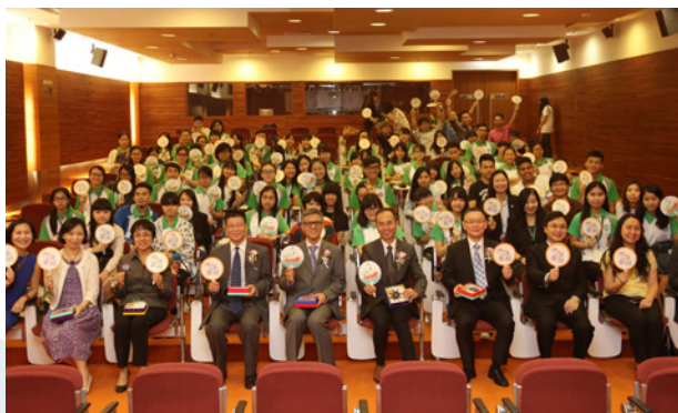
“Mid-Summer Art-ship” – the First MPI Cultural and Creative Summer Camp

The participating students were then advised to make use of existing materials on the site of the Boat Factory and to base on their inspirations from this experience, to work as separate groups in MPI Arts and Design studios to produce cultural and creative products. To achieve this, they could apply various media and art production techniques such as photography, illustration, 3D design, Cyanide blue print art production, imitation blue and white porcelain etc. On 6 July, all participating students were invited to showcase their own creative products at the Creative Art-ship Products Fair to get hands-on experience of the marketing and sales of cultural and creative products. As such, the Mid-Summer Art-ship Camp should have not just offered students a golden opportunity to experience cultural and creative practice, but also raised their awareness of conservation and revitalisation of the Lei Chi Yun Boat Factory in Coloane, which culminate in developing their affections to the heritage of local history and culture, as well as community economy and cultural development. These hopefully can give rise to more knowledge, more care, and more love shown to the cultural and creative industries.