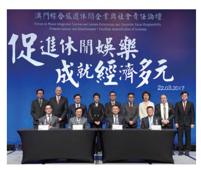
"澳門綜合旅遊休閒企業與社會責任論壇: 促進休閒娛樂 成就經濟多元"由新濠博亞娛樂承辦

The Forum on Macao Integrated Tourism and Leisure Enterprises and Social Responsibility, sponsored by the Liaison Office of the Central People's Government in the Macao Special Administrative Region, was held from 27 April 2016 to 27 April 2017, during which period seven forums were completed. The first forum was held at MPI. The other six forums were successively hosted by the six major tourism and leisure enterprises in Macao. The series of forums were high-level and had great social influence. They were highly regarded by the Liaison Office, the government, the industry, the media and the public. Each forum was attended by speakers who were senior executives from the six major tourism and leisure enterprises in Macao. The researchers of the Centre made summary reports and comments at the end of each forum. A total of more than 3,000 participants participated in the seven forums, arousing the enthusiastic attention and follow-up of the major media. In addition, the Centre also actively participated in the MGS Entertainment Show 2016, a local gaming industry event, and Global Gaming Expo (G2E) Asia, an international gaming industry exposition.