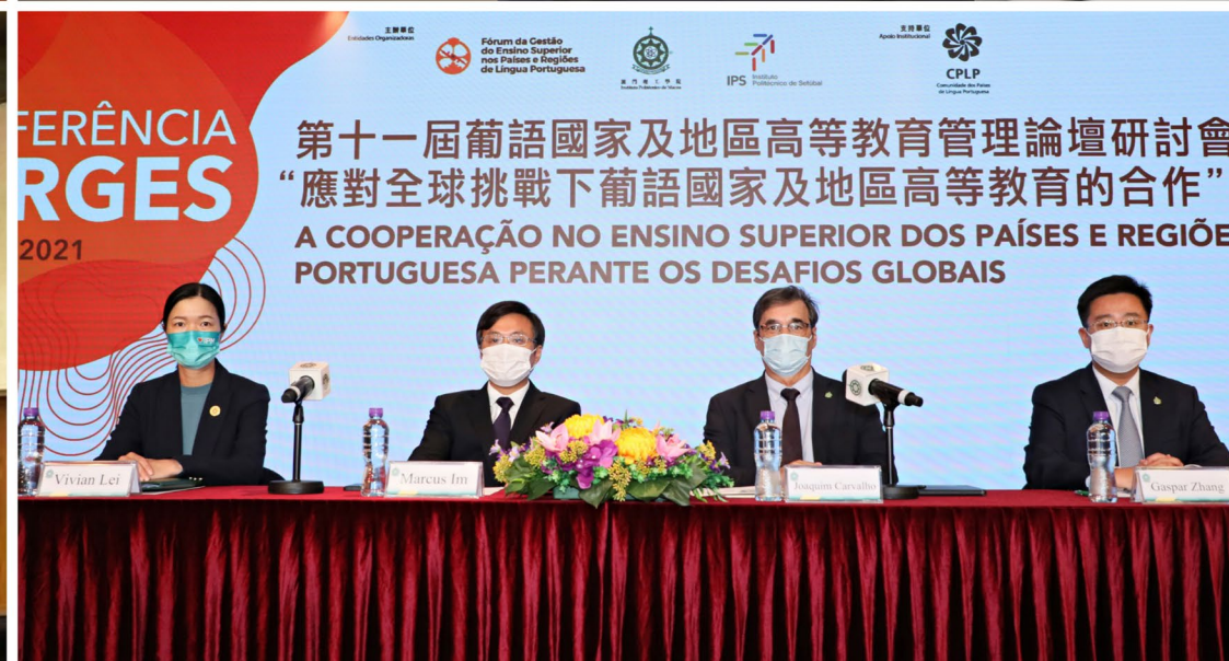
澳門特別行政區行政長官賀一誠、葡萄牙共和國總統馬塞洛·雷貝洛·德索薩在“第十一屆葡語國家及地區高等教育管理論壇研討會”開幕式致歡迎詞 The Chief Executive of the Macao SAR, Ho Iat Seng, and the President of the Portuguese Republic, Marcelo Rebelo de Sousa, delivered welcome speeches at the opening ceremony of the “11 th Forum on Higher Education Management in Portuguese-speaking Countries and Regions”.